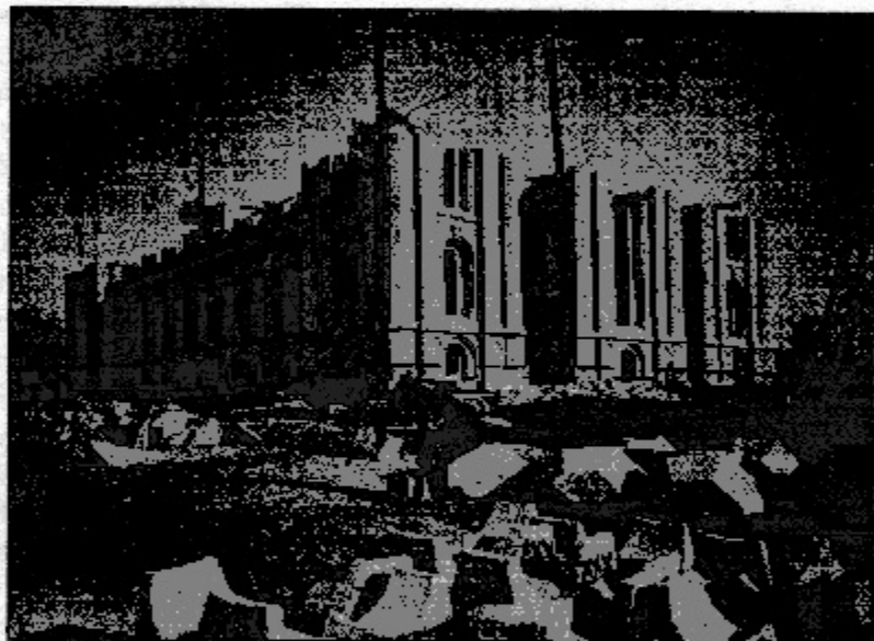
Eventually four large derricks were used at the temple site to swing the stones into place after the workers had hooked the stones onto winch lines.